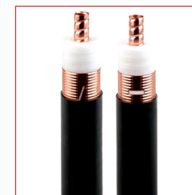
MIMO Radiating Cables